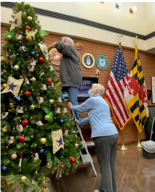
Members of the Patuxent River Unit decorated a tree at Charlotte Hall Veterans Home in Southern MD. A few were camera shy.