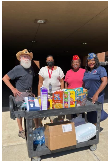
Durham VA Day of Service.