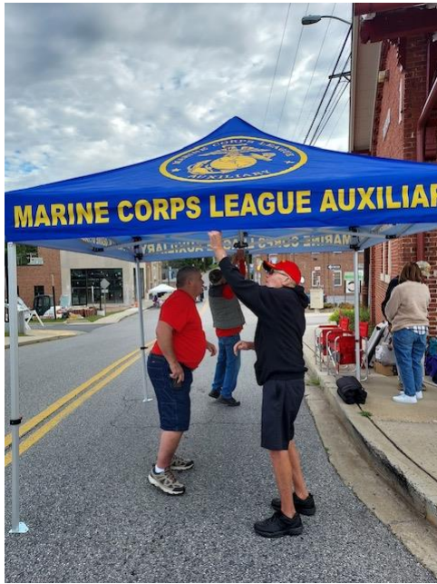
Members of the LCpl Robert W. Deane Detachment helping the Unit setup.